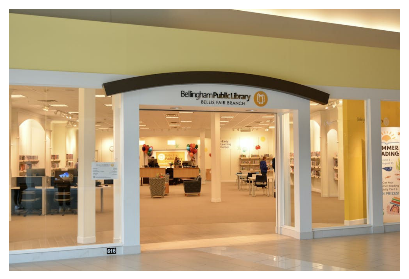
Bellingham Public Library's new branch at the Bellis Fair Mall opened Wednesday, April 26. The library offers a diverse collection of books for all ages and organized Storytimes for young children.

New Bellis Fair library branch expands reading opportunities, services in northern Bellingham By <u>Isabel Hyde</u> April 29, 2023 | 7:00pm PDT