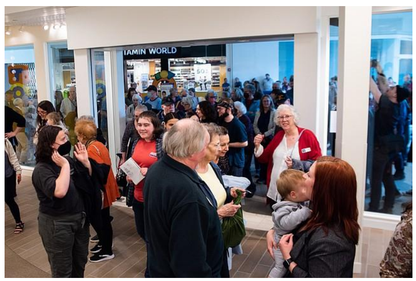
The first visitors of the Bellis Fair branch stream into the library.