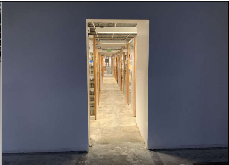
And then there are the doors....the mystery door opening and another door to be removed