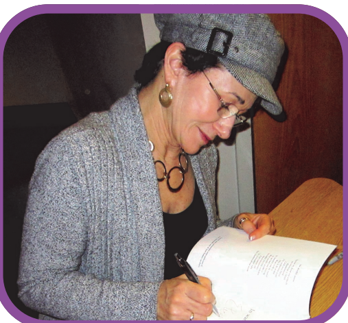
Best-selling mystery author Elizabeth George signing books as part of the Whatcom READS! program in February.