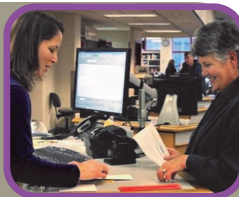
Mayor Kelli Linville updates her library card.