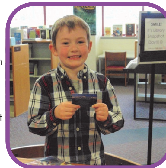
The excitement of a first library card!

At the end of the year, we opened the Dodson Room as an Early Learning and Literacy Center for families with young children. Whenever the room is not in use for a storytime or other children's program, families may gather there to read board books, do puzzles, and play with toys aimed at increasing early literacy skills. We anticipate further upgrades to this space in the coming year.