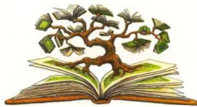
Friends of the Bellingham Public Library

In addition to the Children's Book Sale on August 10, the Friends of the Bellingham Public Library will hold their regular August Book Sale, which runs: